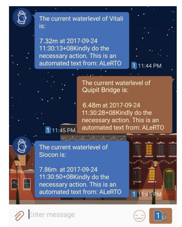
Figure 5. Sample SMS Message

The Figure 5 image shows a sample SMS warning systems that is sent by the ALeRTO device to the registered user, the registered user can be the Local Government Unit, specifically the Local Disaster Risk Reduction and Management Officer (LDRRMO), who is responsible for the disaster related events in the City or the Municipality. Aside from the LGUs, other stakeholder can also register in the ALeRTO system.