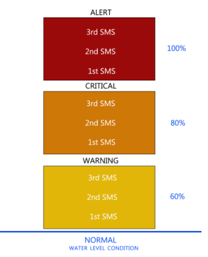
Figure 2. Threshold Levels

The program will also compare if there are changes in water level. If there is a change, it will send sms every 10 mins (or depending on the sensor), especially if the threshold is at the critical, going to alert level. Once the system identifies that the river already reached 60% full (warning condition), monitoring of the water level of the river is then intensified.