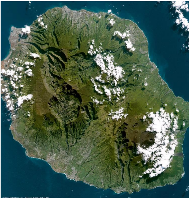
Figure 3: LA REUNION ISLAND, FRANCE

In 2014, Airbus Defence and Space launched its last bird, SPOT 7, completing the SPOT 6/7 constellation, phased on the same orbit as the two Pléiades. At the same time, a strategic cooperation agreement has been signed with Azercosmos, which consisted in the implementation of Earth Observation service infrastructures in Azerbaijan, including the transfer of ownership of the SPOT 7 (a.k.a. Azersky) satellite to Azercosmos. It also contained the provision of a complete ground system, together with training and capacity-building programs in order to support Azercosmos in the operation and development of Earth Observation data based services as well as value added production. This partnership is an opportunity for Azercosmos to build up its own experience in operating an Earth Observation system and taking benefit of a strong and experienced partner to develop its commercial footprint in an efficient manner.