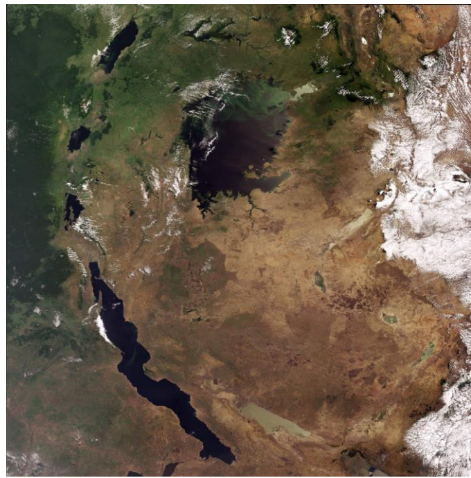
Figure 1: ENVISAT IMAGE, EAST AFRICAN RIFT