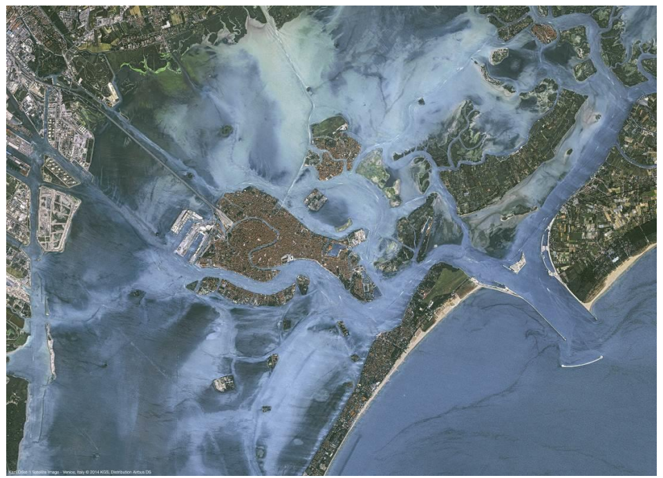
Figure 4: KAZEOSAT-1 ON VENICE, ITALY

The most recent partnership Airbus Defence and Space entered in is with Kazakhstan Gharysh Sapary (KGS) and concerns the distribution of KazEOSatsatellites. This collaboration enriches the Airbus DS' portfolio with data from two KazEOSat-2 is a 6.5m resolution optical system with 5 multi-spectral channels, including a red-edge band. This spectral range, between the classical red and near infra-red ones, is characterized by a rapid growth of the vegetation reflectance. It is then particularly suitable for applications related to the monitoring of the growth and status of vegetation. KazEOSat-1 is a very high-resolution images at 1m GSD, which is designed for high quality mono and stereoscopic monitoring over challenging areas. It is an ideal tool for topographic mapping, up to 1:15,000, offering rapid collection and delivery of tricky targets, may it be for defence or oil and gas purposes.