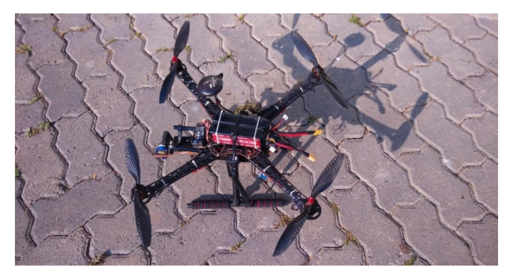
Figure 4.1- Quad Copter

Centre for Research and development developed a military type quad copter. Furthermore it is embedded with following capabilities, Video streaming, geo tag image capturing, it can travel speed of 20ms-1. With the existing batteries it has more than a 15 minutes flight time. During that period it can fly around 2.5Km. Quad copter is connected with GPS, Electronic compos and air pressure sensor for its navigation use. Camera is fitted with gyro stable gimbal to obtain undisturbed photos. It can operate manually and autonomously. Quad copter frame and other hardware is made out of light weight carbon fibre and it has the capability of carrying around 1Kg pay load.