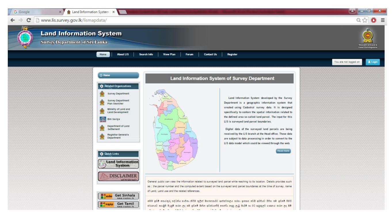
Figure 4.0 Home Page of the LIS web site

In the LIS website users can get register and the site adminstrator will decide the users access level. There are different user levels and the registered user becomes a general user by default having lowest access rights (for eg; viewing only). Figure 4.0. shows the home page of the LIS site. The free map services such as Google Map, ESRI Images, Microsoft Bingmaps being integrated to use as a background map for convinient viewing of the parcel information in the LIS. Those free services facilitates the general user to locate the parcel of interest without any ambiguity. The intension of use of those data layers were directly depend on the current trends of information search by general internet users. It is possible to switch the user interested background data or can view only the parcel information by switch off all the background maps.