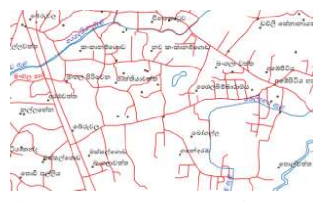
Figure-2: Standardized geographical names in GIS layers

Office staff of Geographical Names branch of Survey Department follows the guidelines and principles defined by the CSGN. Data collected through GND officers and other means are used for processing. All standardized data are submitted to the CSGN for their views and approval. All problematic names are also submitted to the CSGN for their final determination. GIS compatible data layers are updated using the information marked on maps and comparing them with satellite images. Road names, are checked with local authorities as local authorities have a mandate for naming roads. Standardized geographical names are shown in GIS data layers. Figure-2 shows part of the Beruwala Divisional Secretariat area.