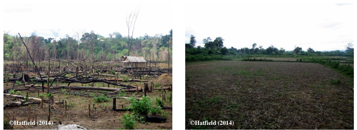
Figure 2. Field survey: shifting cultivation adjacent to mining area (left); permanent agriculture (right).

objects where the average heterogeneity is minimized and the homogeneity of the image objects are maximized. The rule-set was developed using a subset from two field surveys (Figure 2) conducted in May 2013 and November 2013, as well using the high resolution satellite images.