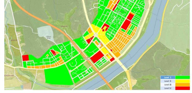
Figure 6. Pyeonggeo-dong Fire Risk Map