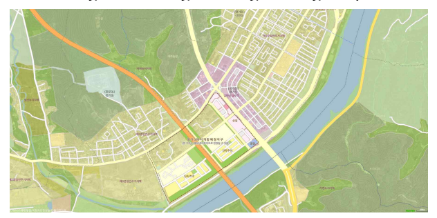
Figure 5. Pyeonggeo-dong Zoning Map