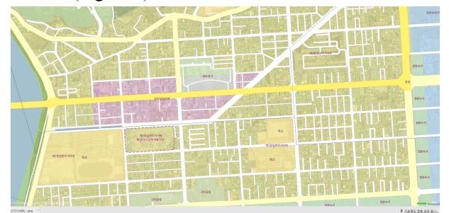
Figure 3. Sangdae-dong Zoning Map

Based on classes of fire risk according to facilities, which were analyzed above, this study selected Sangdae-dong which is an area, where industrial complex and residential area are intermingled based on the classes of fire risk according to facilities, and Pyeonggeo-dong, where residential area and neighborhood commercial area are intermingled, thanks to the new land development. Subsequently, it designated fire risk of facilities according to the land use and manufactured fire risk, classified as 4 classes (Fig. 3-6).