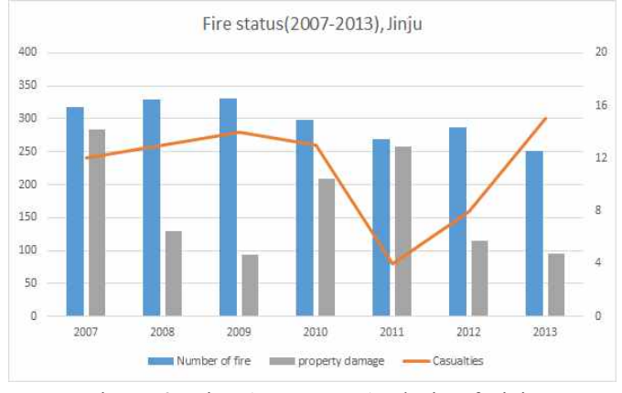
Figure 2. Fire Assessment Analysis of Jinju