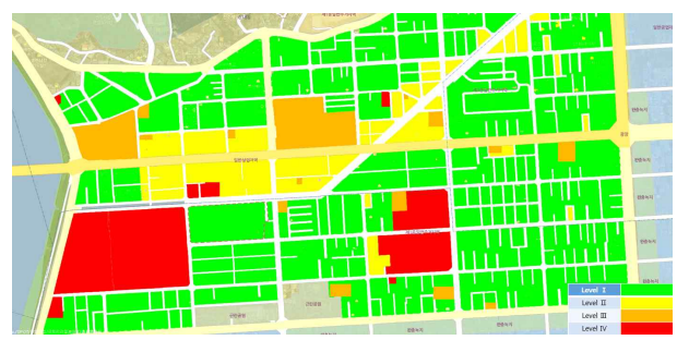
Figure 4. Sangdae-dong Fire Risk Map