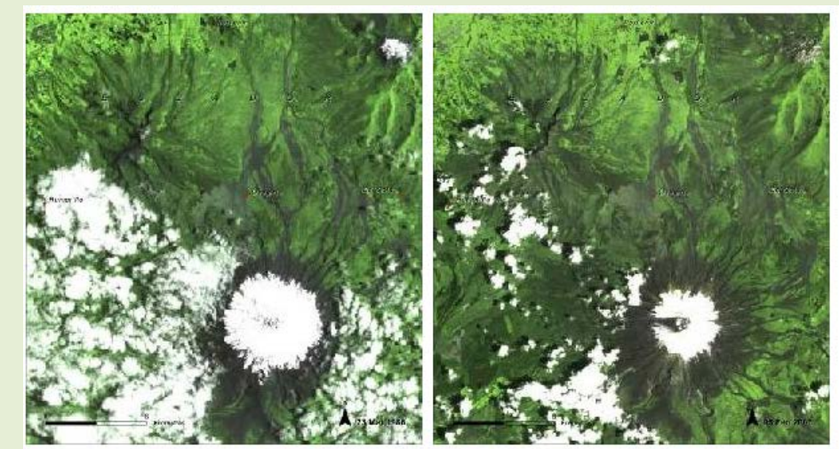
Cotopaxi (Ecuador) 1976 (left) - 2006 (right).

Defining and analyzing drivers of policy issues as clearly and concretely as possible (e.g. number of people affected, economic losses, and future trends) can yield major budgetary savings, while improving adequacy of response, and reducing further disagreements amongst stakeholders (Guess and Farnham, 2000; UNEP, 2009). Gathering facts, evidences, and arguments to document and communicate the issue precisely, is therefore essential (UNEP, 2009). In this context, special focus should be given on clearly distinguishing between the symptoms of the problem and the problem itself. In fact, policy responses typically concentrate on reducing pressures – the short-term effects instead of thinking about tackling drivers – the causes (UNEP, 2012). The reconstruction and mitigation projects undertaken in Honduras in the aftermath of hurricane Mitch are good examples of the latter (Winograd, 2007, see Case study 3).