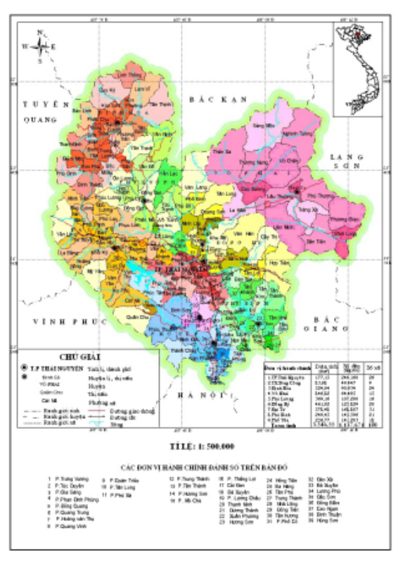
Figure 1: Administration E.Atlas of Thai Nguyen Povince

Atlas includes official map pages and is arranged as follows: