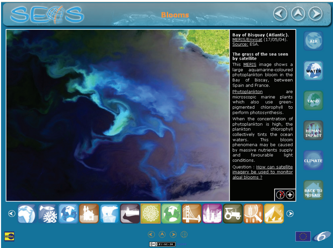
Figure 3: A webpage on marine phytoplankton blooms in the tutorial A World of Images, showing a bloom in the Bay of Bisquay. Explanations in the black window (activated with a click at the 'i' symbol) include links to other more detailed SEOS pages. The full resolution image can be accessed with a click on '+'. Navigational arrows allow to flip pages. Logos lead to other topics of Earth observation..