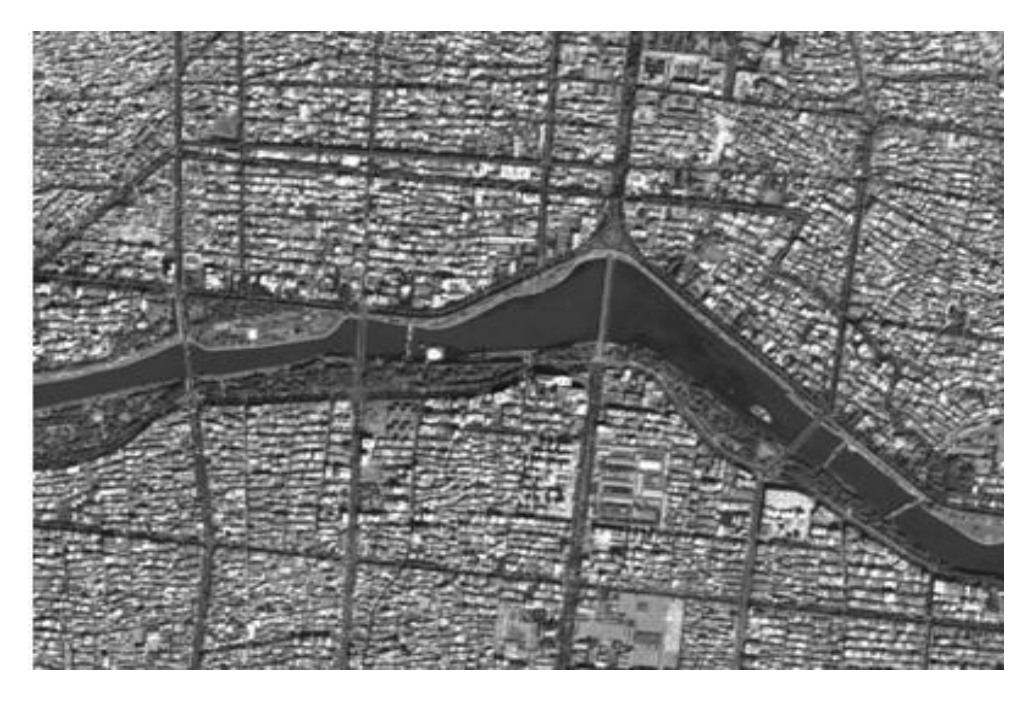
Figure 1. The part of Ikonos satellite image

The case study for performing the suggested method to produce the base maps is located in Isfehan city of IRAN. The geographic extents for this area is: Latitude from 32^{\circ} , 36' to 32^{\circ} , 40' and longitude is from 51^{\circ} 38' to 51^{\circ} 43'. The Ikonos satellite image of the case study is shown in figure 1.