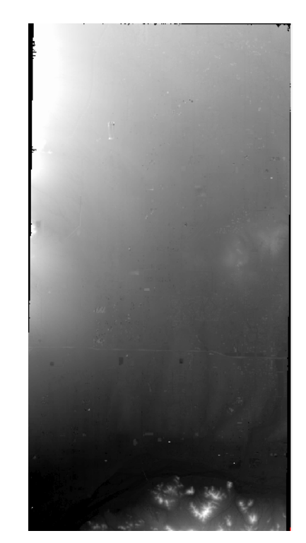
Figure 2b: Phoenix extracted DEM

Figure 3a and 3b show a stereo dataset of a mining site in Australia and the extracted DEM. The stereo pair has a fore looking angle of 20.0 degrees and an aft looking angle of -8.2 degrees. The extracted DEM has a vertical RMS error of 3.9m with a maximum error of 5.7m when compared to the control points. Eleven GCPs were collected from each image. The GCPs were not as accurate as in the previous two cases because they were extracted from an ortho airphoto mosaic. When no GCPs were collected, the check point RMS vertical error was 2.2m, with a maximum error of 4.7m. When only one GCP was collected from each image, the check point RMS vertical error was 3.9m with a maximum error of 5.7m. These results show that if accurate GCPs are not available, it may be preferable not to collect any GCPs at all. The absolute RPC model accuracy of WorldView data without GCPs is sufficiently accurate to generate a DEM. More examples of WorldView DEM extraction can be found in Cheng (2008).