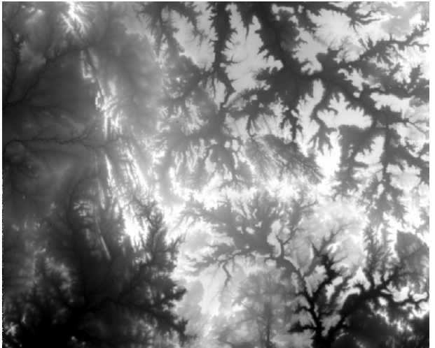
Figure 3b: Extracted DEM