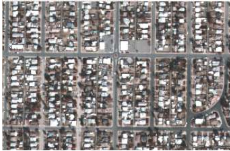
Figure 1b: Multispectral image of Phoenix, USA