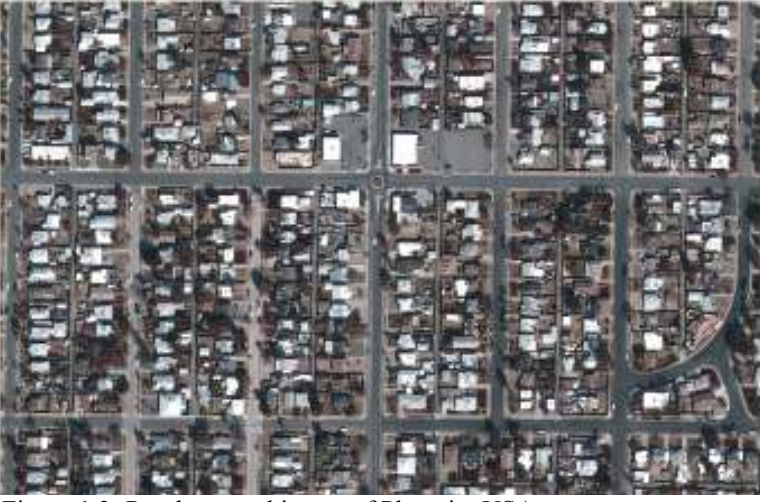
Figure 1.3: Pansharpened image of Phoenix, USA