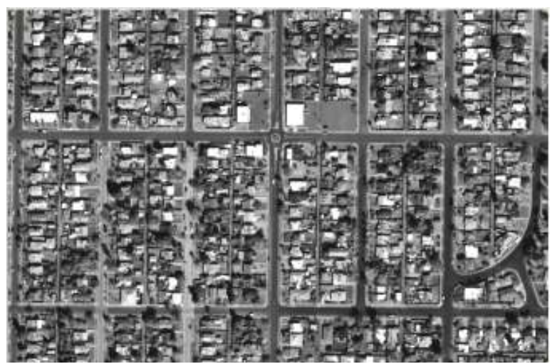
Figure 1a: Panchromatic image of Phoenix, USA