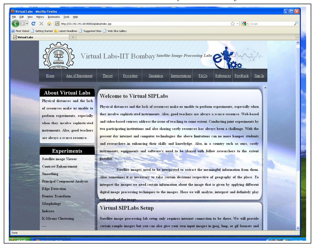
Figure 1. Front-end of the Virtual Lab

The actual experiment is implemented using Matlab and compiled into an executable that reads the relevant inputs for the experiment for a file. Using a html user-interface the user is