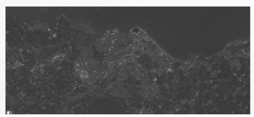
Figure 4. Interpretation Module