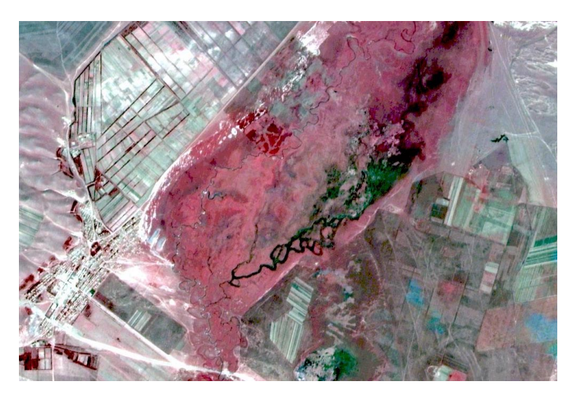
Figure 3 Fusion image of CBERS-1 with SPOT