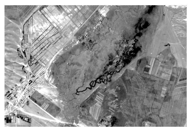
Figure 2 SPOT image of panchromatic band