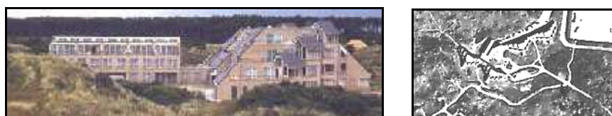
Figure 4: The Ostrea Apartment Complex seen from ground (VVV, Ameland, 2000) and on the airphoto.

Apartment buildings: It is relatively easier to recognize the apartment buildings on the airphotos because their locations (outside villages, near the beach and camping sites), big buildings in groups and the car parks (figure 4).