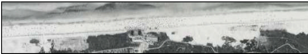
Figure 2: The beach in the north of Nes in 1969.

Sea, sand and sea: Some beaches used for tourism can be identified easily when the airphotos are taken in good weather in tourist high seasons because recreational and tourist activities increase in such conditions. See the beach on figure 2, the little black dots are windscreens on the beach.