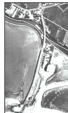
Figure 6: The recreational boats in the yachting harbour.

Yachting harbour: Between the two dams, some boats can be found on the airphotos. These boats are mainly used for recreation. The big boats on figure 6 which are also used for seal-tours. The smaller boats are privately-owned yachting boats.