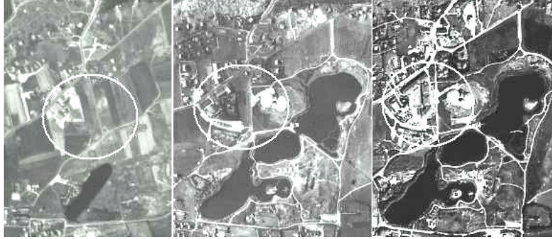
Figure7: The lake area in Village Nes on photos: 1969 (left), 1992 (middle) and 2000 (right).

By studying series of aerial photographs of year 1969, 1992 and 2000, the changes in tourism product of Ameland can be detected. Here is an example (figure 7):