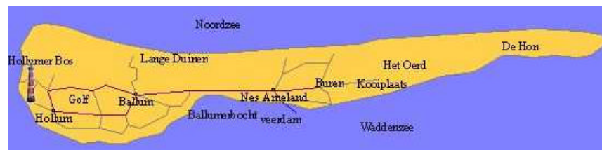
Figure 1: General map of Ameland (EcoMare, 2000).

Ameland has four villages: Hollum, Ballum, Nes and Buren (Figure 1).