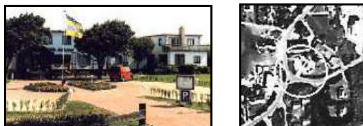
Figure 3: Hotel Ameland seen from ground (VVV Ameland, 2000) and on the airphoto.

Hotels: For hotels inside villages, it is rather difficult to identify them on the airphotos of the scale 1:18000. Inside villages the assumption that all large buildings have a recreational function is less valid, because a number of other functions can be expected to have large buildings too: school, church, supermarket and museum, etc. Large building outside the agricultural area and villages that is too large to be individual summer houses can be assumed to serve recreational purposes, simply because that is the only likely function to be expected here on basis of local reference knowledge. A further specification can not be given without field information. (Zee, 1992). Hotel Ameland which has a round car park with grassland in two half circles is easily identified on the airphoto (figure 3).